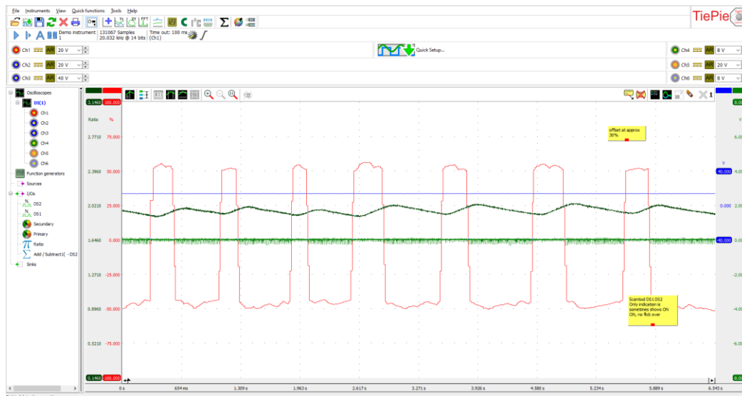
Six channel recording CVT transmission