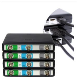
Sample of combined scopes (ATS 500XMs)

To couple the instruments, one coupling cable is required to couple two scopes, two cables are required to couple 3 scopes, etc..