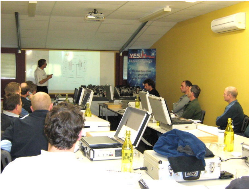
Automotive diagnosticians (YES inc. members) training with AECS.