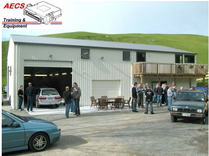
AECS' custom build training, research and development centre

We often find that this information is really appreciated by highly skilled technicians.