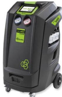
Brainbee Clima 9450 | R1234yf