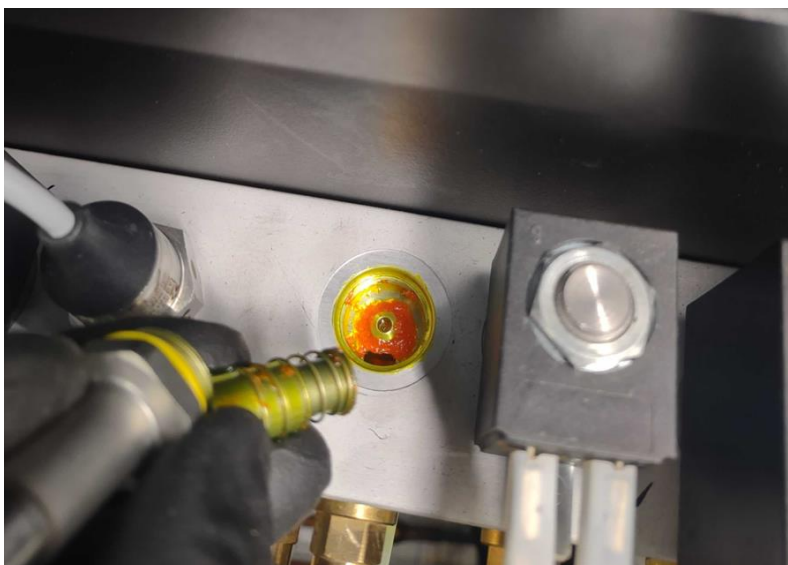
UV dye introduced Stop Leak.

The complaint from this particular 11 month old machine was that the UV Dye injection did not work anymore. After removing the valve we saw an orange blob which is stop leak mixed in the UV dye used by this customer.