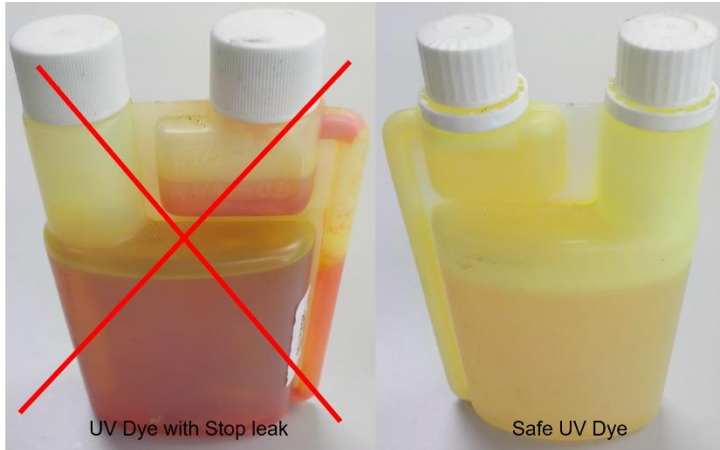
Two almost identical bottles of UV Dye, one contains Stop Leak.