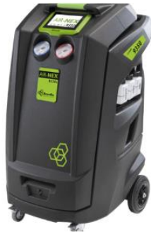
Brainbee Clima 9350 | R134a

Dear reader, below is a report that you might find useful for your own workshop.