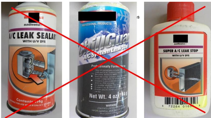
Samples of stop leak products

During our AC training seminars we spend a little bit of time on Stop Leak products.