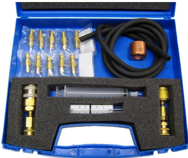
AECS Stop leak test kit.

Stop leak can also be introduced in your machine by an infected AC system. We have a simple to use kit available that in a matter of 3 minutes will show if a system contains Stop Leak. The kit's detector can be reused over and over again until the replaceable detector gets damaged by Stop Leak.